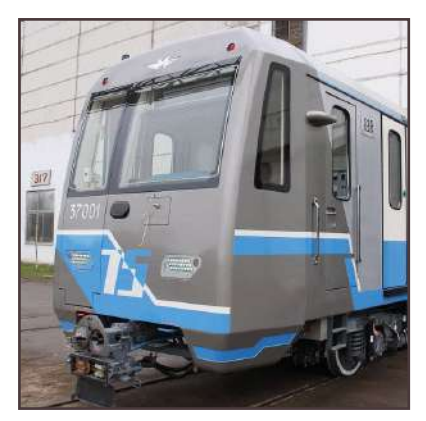
Window Protection Film - BULGARIA