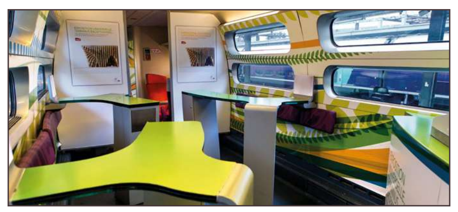
TGV Interior Decoration - Milano 2015 Expo- FRANCE / ITALY