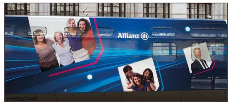
Short Term Campaign on TGV - FRANCE