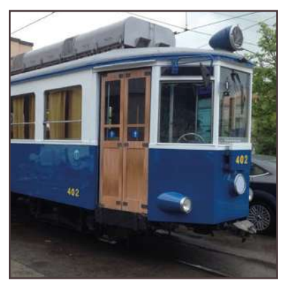
Trieste Tram - ITALY